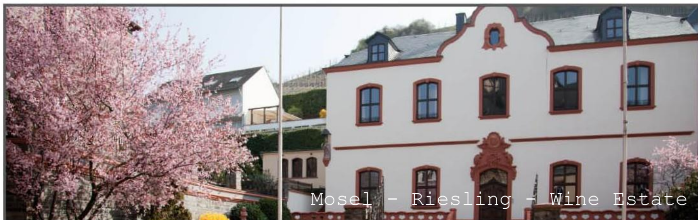
Mosel - Riesling - Wine Estate